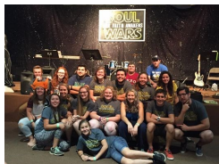
2016 "CAZ KIDZ KAMP" Student Leaders

We will be meeting in Yu- ma on Tuesday, October 11 th at 11:00 at DaBoyz downtown. Come and help us as we have this important conversation!